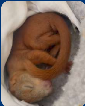
This baby squirrel was rescued and given refuge at the Wild Animals Rescue Center.